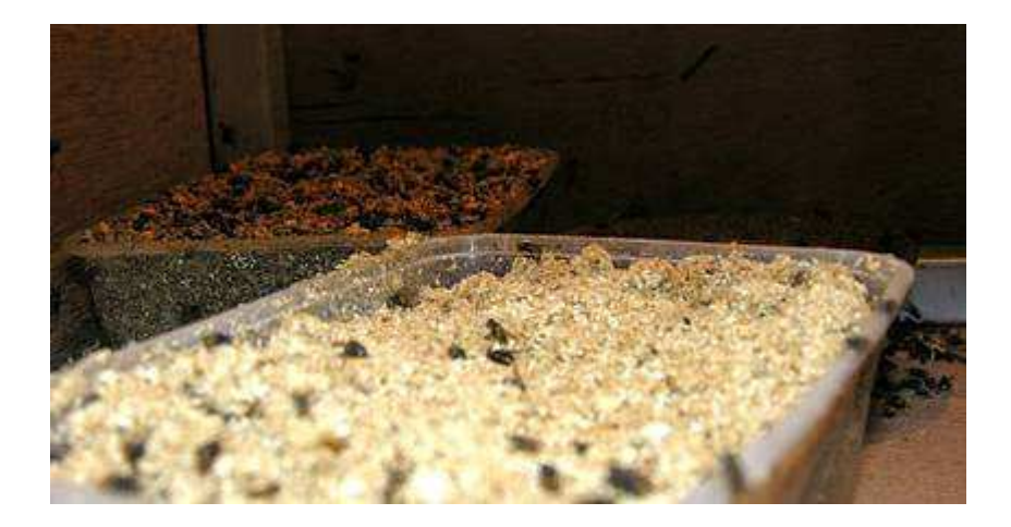
On the floor sits the egg laying container, maggot/fly container and sugar bowl.