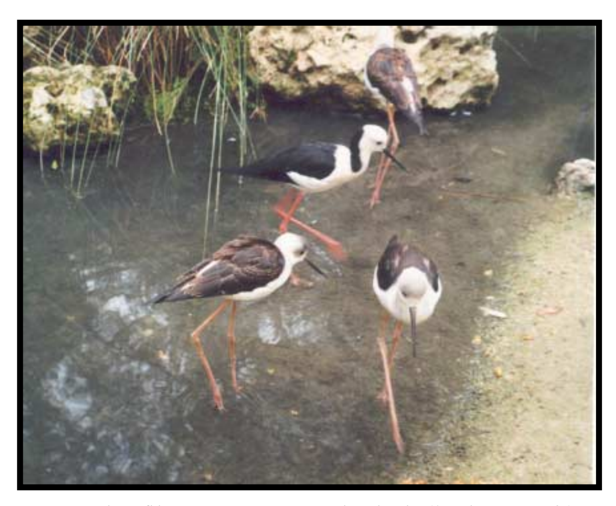
Black-winged Stilt adult surrounded by three juvenile stilts (Adelaide Zoo, Dec. 97)

By Alexandra Emmerich Adelaide Zoo October 2000